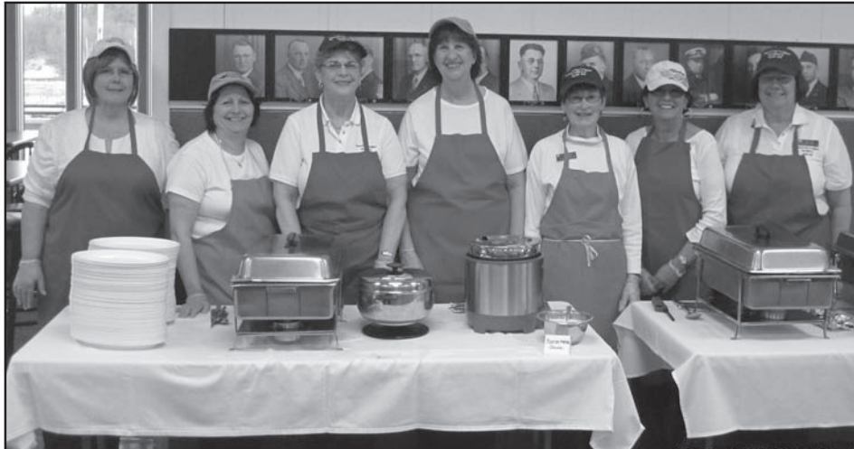
Ladies Auxiliary members serve the Prime Rib Dinner at the 94th American Legion Birthday Dinner.