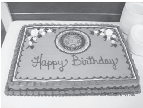
The American Legion Birthday cakes were provided by the Ladies Auxiliary Past Presidents.