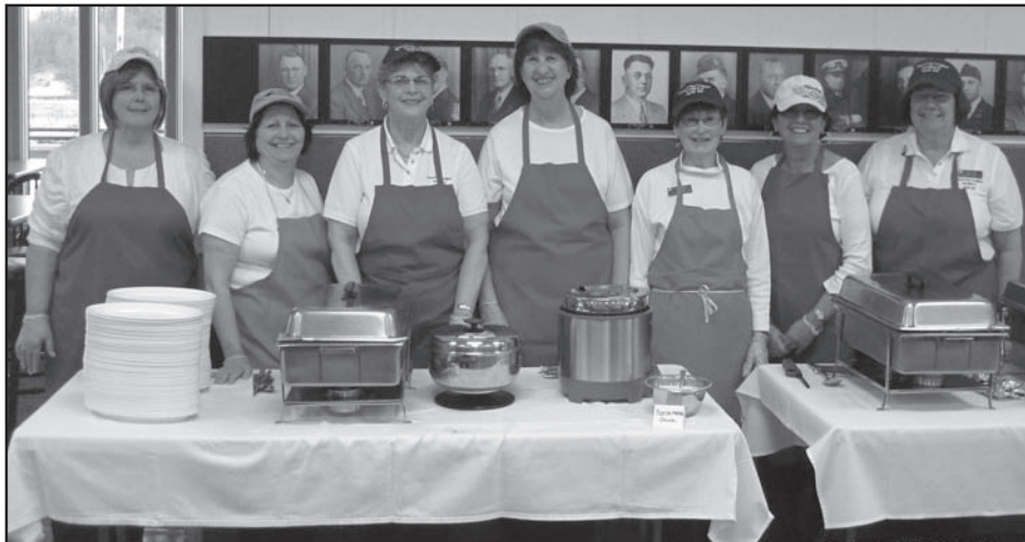
Ladies Auxiliary members serve the Prime Rib Dinner at the 94th American Legion Birthday Dinner.