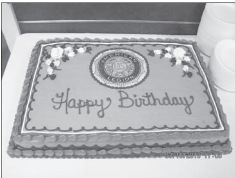
The American Legion Birthday cakes were provided by the Ladies Auxiliary Past Presidents.