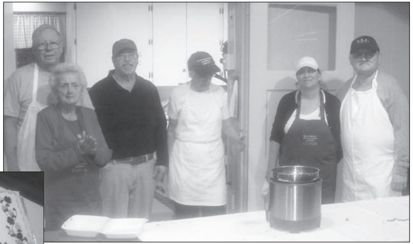
Members for the Ladies Auxiliary and SAL helped prepare the dinner for the American Legion Birthday Party.