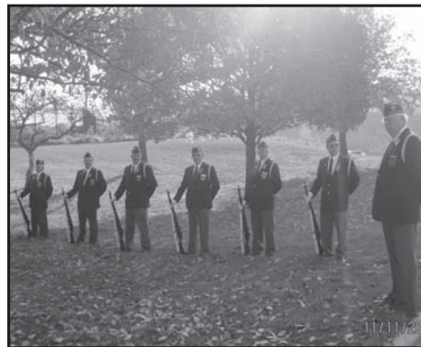
Rifle Team at Veterans Day Program at the Eternal Flame Nov. 11, 2010