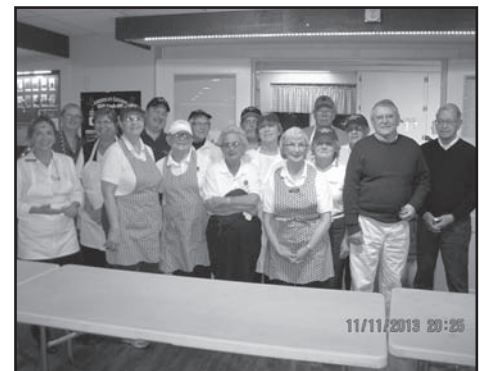
Members of the Ladies Auxiliary and SAL, team up to help prepare the Veterans Day Dinner.