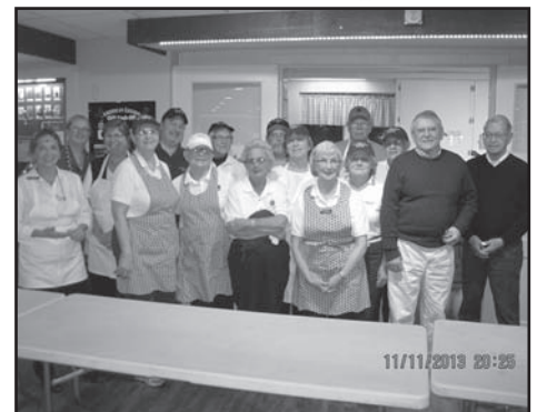
Members of the Ladies Auxiliary and SAL, team up to help prepare the Veterans Day Dinner.