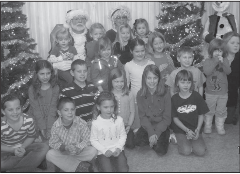
Kids Christmas Party 2010