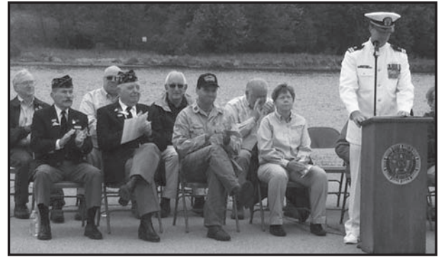
Memorial day program at the Grand Haven Waterfront.