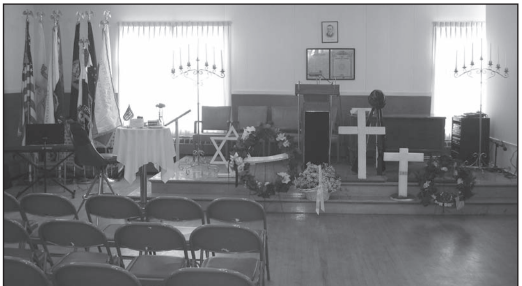
5th District Memorial Service