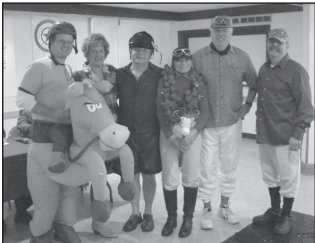
Jockeys from the Kentucky Derby Party