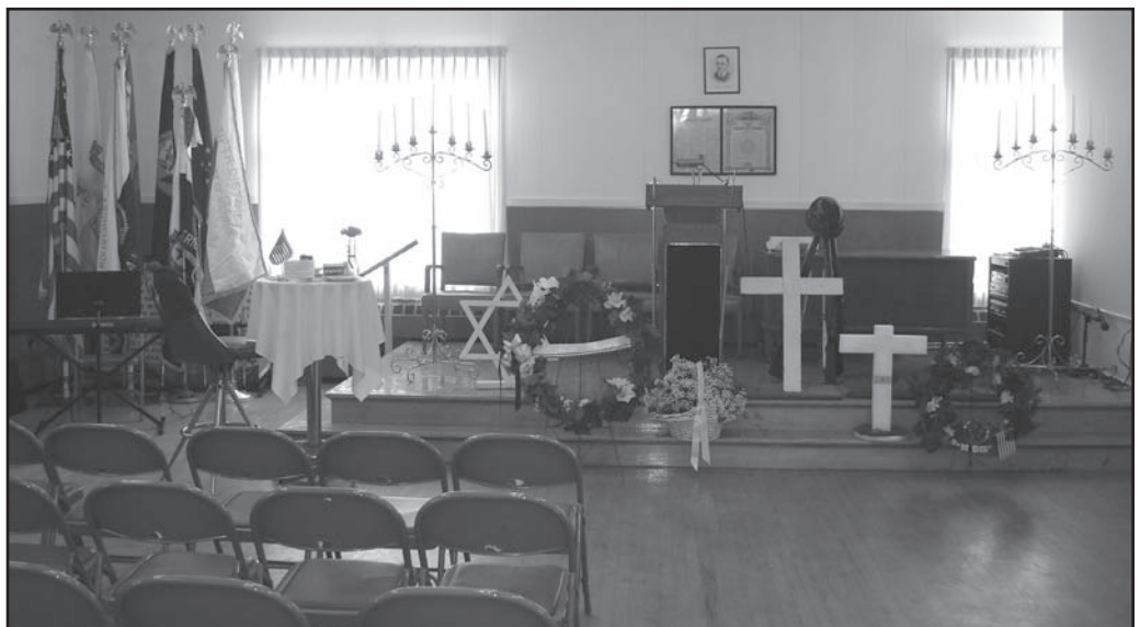
5th District Memorial Service