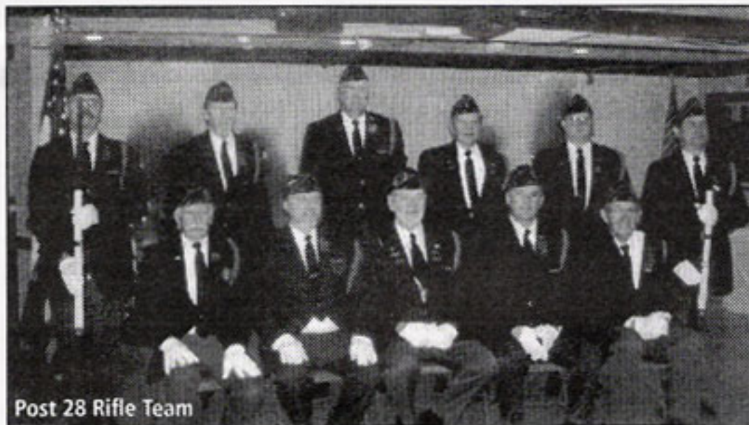
Post 28 Rifle Team