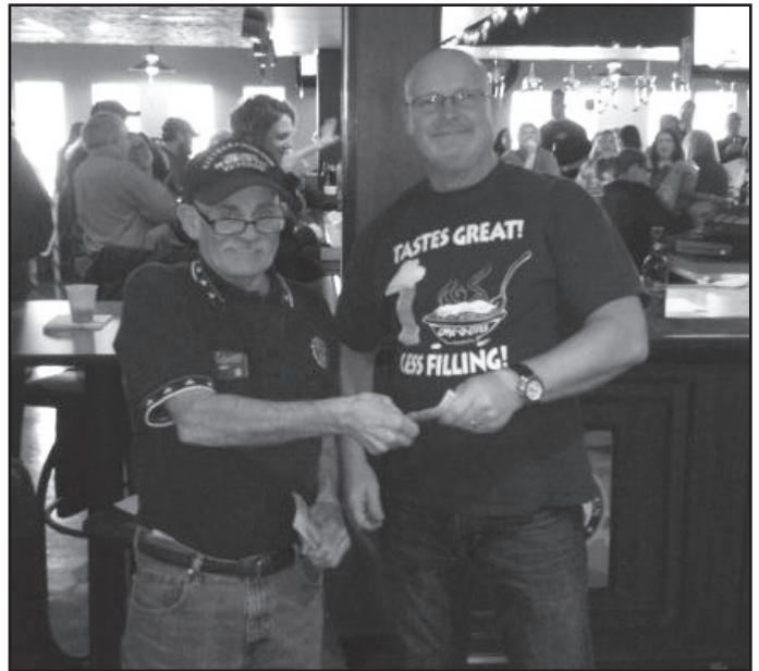
Chili cookoff 2nd place