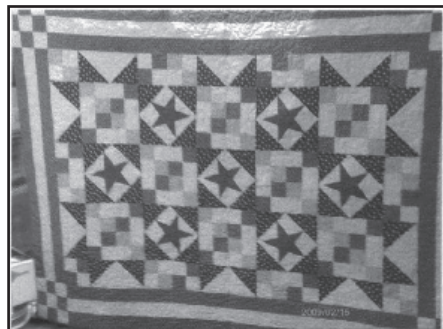
Hand made quilt to be raffled off by the Auxiliary on Memorial Day. Tickets are $5.00 and available at the Post Bar and from Aux. members. All proceeds to benefit the Quilts of Valor and Goodfellows.