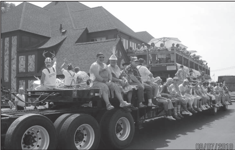
Scottville Clown Band at Post 28 after Coast Guard Parade