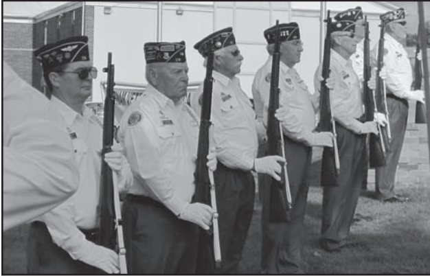
Rifle Team during Memorial program for the Michigan Vietnam Moving Wall.

NON-PROFIT ORG. US POSTAGE PAID PERMIT NO. 129 GRAND HAVEN MI 49417